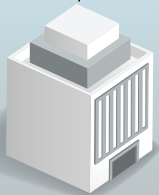
Studio Apartments Kotturpuram